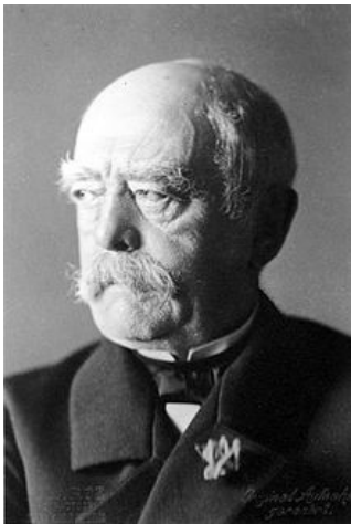
Otto von Bismarck

Leading industrialist Alfred Meinhard was killed yesterday in a fire whilst staying at the Hôtel du Triomphe in the british quarter. Meinhard who owned the Meinhard weapons factory in Heilbronn, Germany was due to attend a business conference at the hotel which was subsequently cancelled. It is believed Meinhard's shares were rapidly purchased allowing the anonymous buyer to gain control of the company.